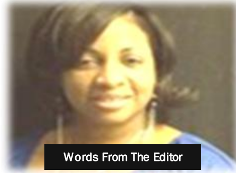
Words From The Editor

A New Year brings new beginnings, with new hopes and expectation. Live your life purposefully, don't waste your time on things and people that are not heading in your direction. Understand you cannot take everyone with you on the 2012 quest. By now you should have evaluated and made some decisions that involves letting go and moving forward .